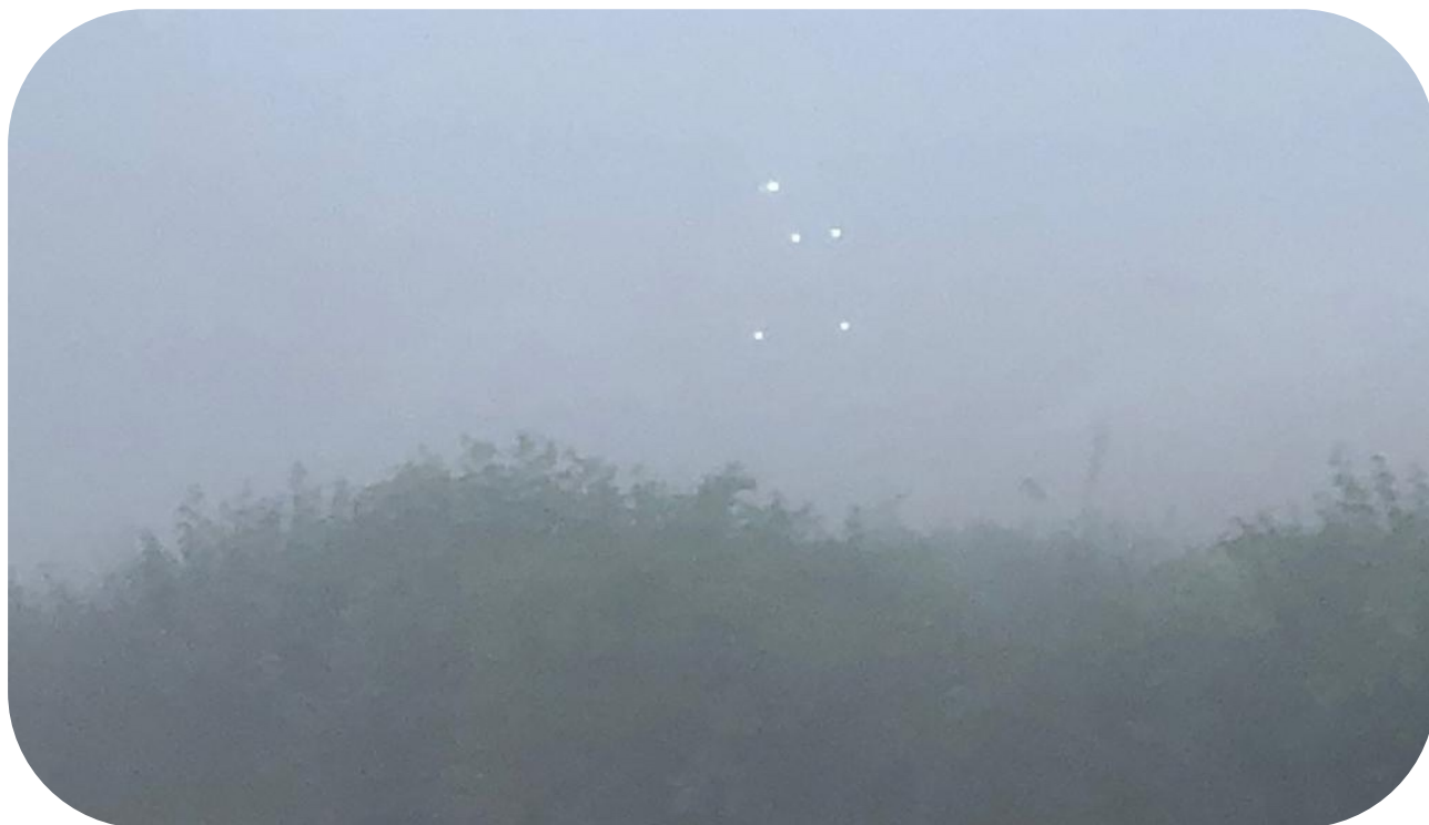
Lights in the sky over Pimperne or what?

Remember, Bag it and Bin it, offending owners can be prosecuted in the magistrates' court where a fine of up to £100 can be imposed.