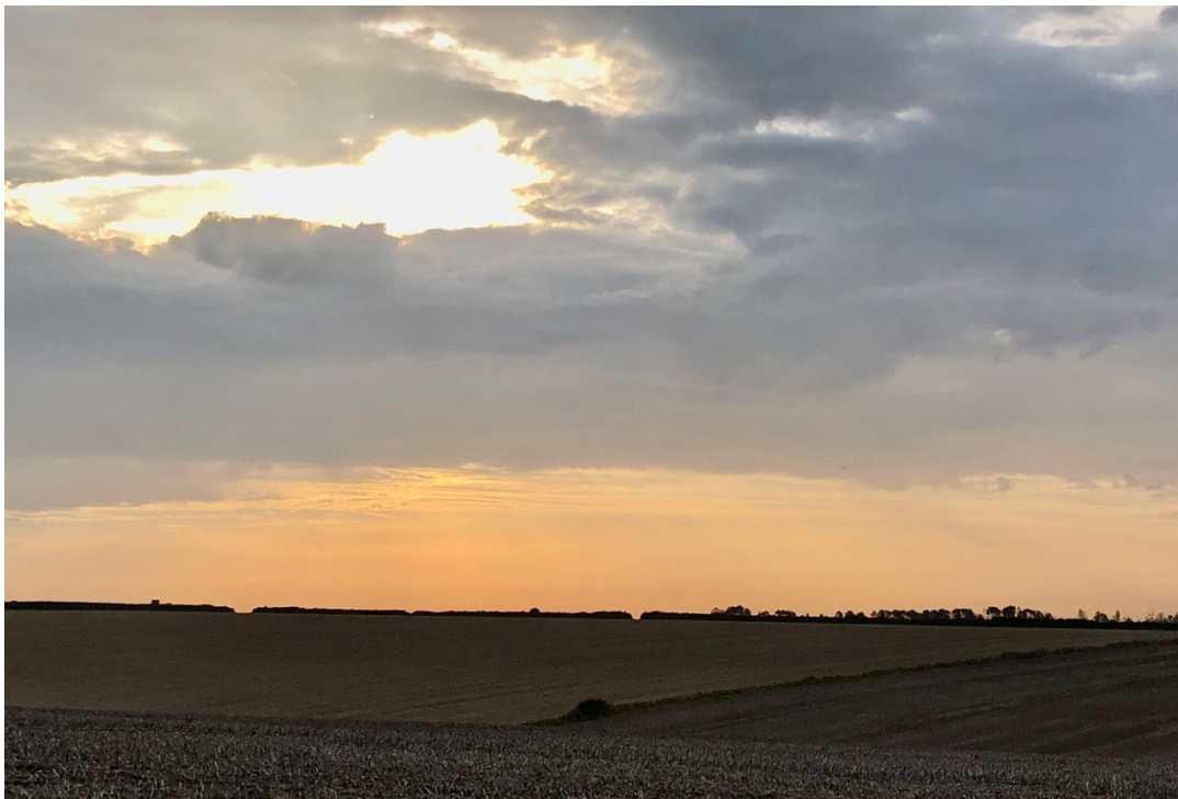
Sunrise over Pimperne