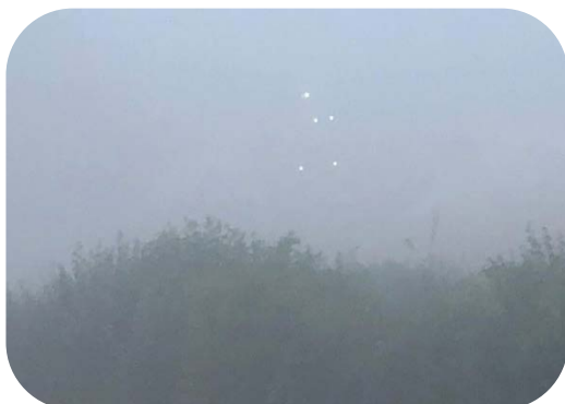
The lights in the sky were excavators working in the fields on a foggy morning at New Field Farm Cottages