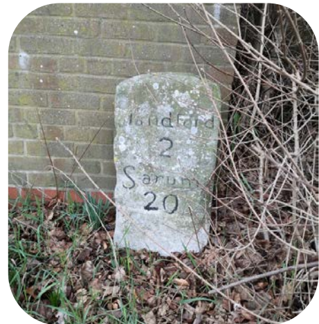
Where is the milestone in Pimperne? Answer in the next issue