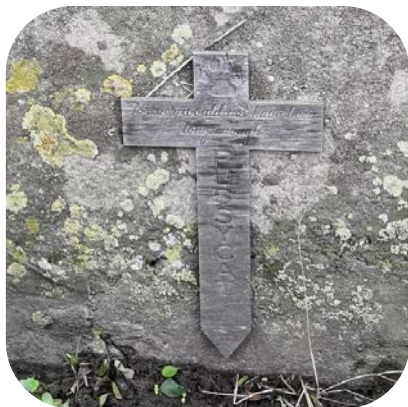
The cross is at ground level on the outside wall of 22 Anvil Road