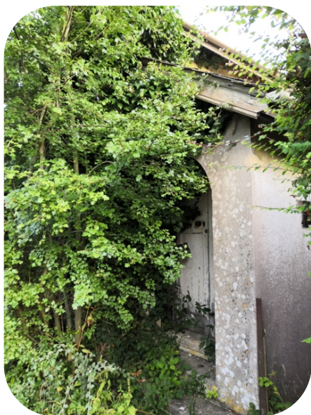
This is the old chapel in Priory Lane.

Remember, Bag it and Bin it, offending owners can be prosecuted in the magistrates' court where a fine of up to £1000 can be imposed.